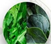
LEAFY GREENS & DANDELION GREENS