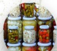
PICKLED VEGGIES (NON-PASTEURIZED)